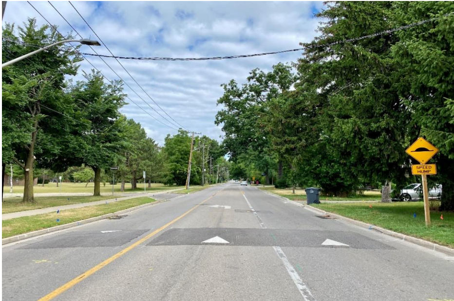
Split speed hump - Lorne Park Road

The split speed hump is the preferred traffic calming device to be installed on Queen Street West. A split speed hump is similar to a speed hump, however does not cover the entire width of the road. Split speed humps are intended to allow for operating speeds of approximately 40km/h while allowing larger vehicles such as buses and emergency vehicles to pass without difficulty.